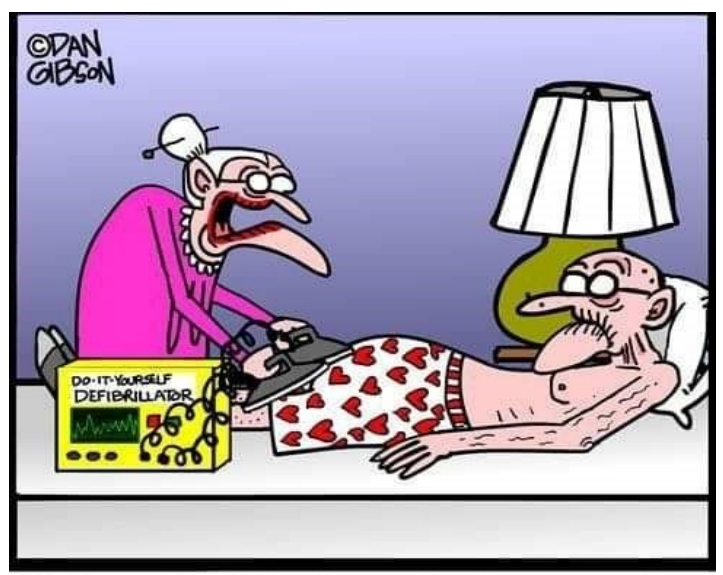
Well, your heart's beating again... Hmmm, maybe we can zap some life back into the ol' meat stick while we're at it!